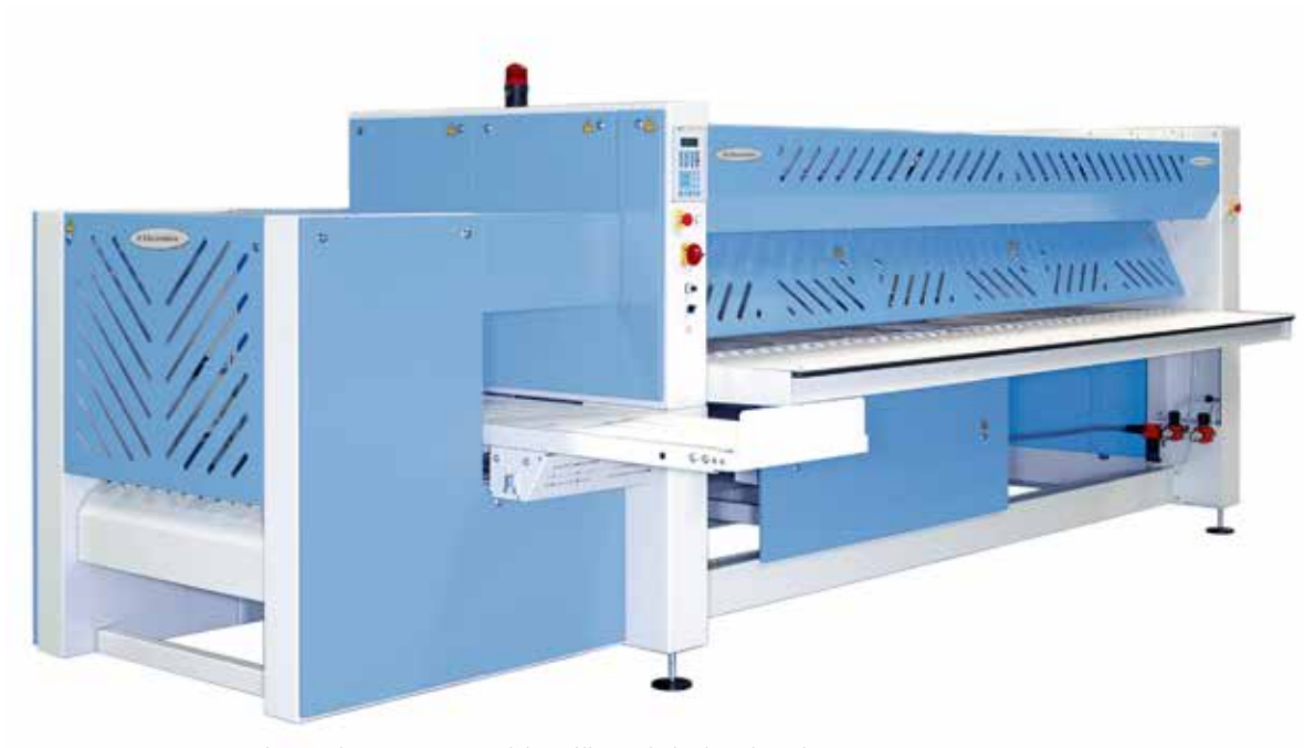
Images shown are a representation of the product only and variations may occur.